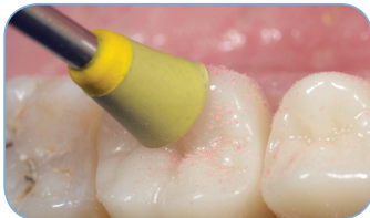
Dialite LD yellow fine polishing cup (W17FLD) for high shine. (Recommended Speed: 5K rpm)