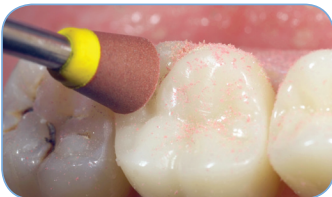
Dialite LD red medium polishing cup (W17MLD) for pre-polishing. (Recommended Speed: 5,000 - 7,000 rpms)