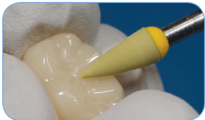
Dialite LD yellow fine polishing point (H2FLD) for high shine.