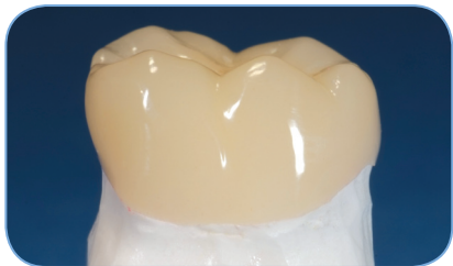
Lithium disilicate crown polished with Dialite LD.