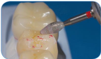
Adjustment of occlusion using football-shaped red-band Dialite finishing diamond (8369DF) (Recommended Speed: 100K rpm)