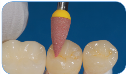
Dialite LD red medium polishing point (W16MLD) for pre-polishing.