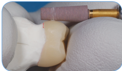
Adjusting and contouring with pink medium LD Grinder (LD13M).